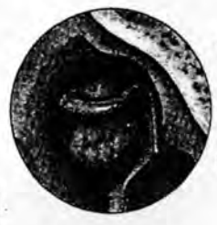
The enlarged adenoid is removed with a curette