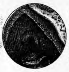
Nasal passage-way and the Eustachian tube are now clear