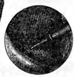
The surgical area is cauterized to stop bleeding