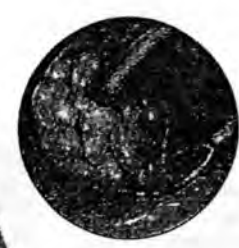
The tonsils are removed through the mouth